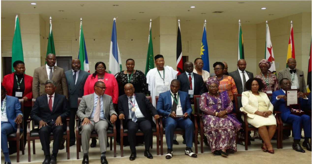
Photo: Dr. Motsoahae Thomas Thabane, The Right Honourable, Prime Minister of Lesotho; Ministers of Education; AU HRST Commissioner; and other dignitaries at the 10th AFTRA Anniversary in Maseru, Lesotho, 2019